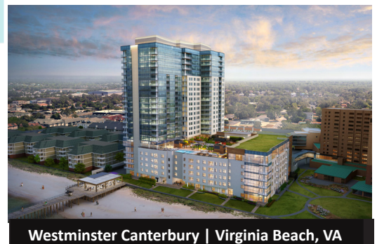
Westminster Canterbury | Virginia Beach, VA

Send your resume and cover letter to resumes@smandf.com ! Please specify which location you're interested in. Once our team receives your application, we'll be in touch!