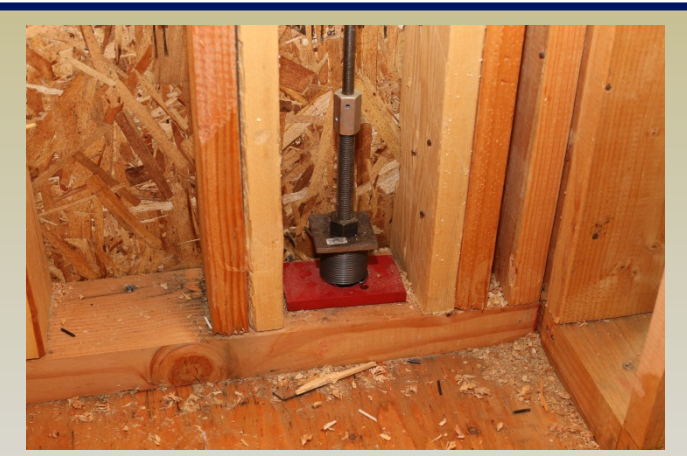
Close up photo of ATS Holddown Coupling device (take-up) by Simpson Strong-Tie. This coupling device takes up the shrinkage that occurs in a wood structure to allow the use of a continuous system from roof to foundation.

ATS (CTRTDS) System by Simpson Strong-Tie