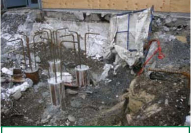
Composite piles in place

2125 McComas Way, Suite 103 Virginia Beach, Virginia 23456