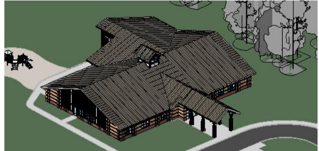
Revit® image depicting architectural elements courtesy of the architect-PMA, Inc.